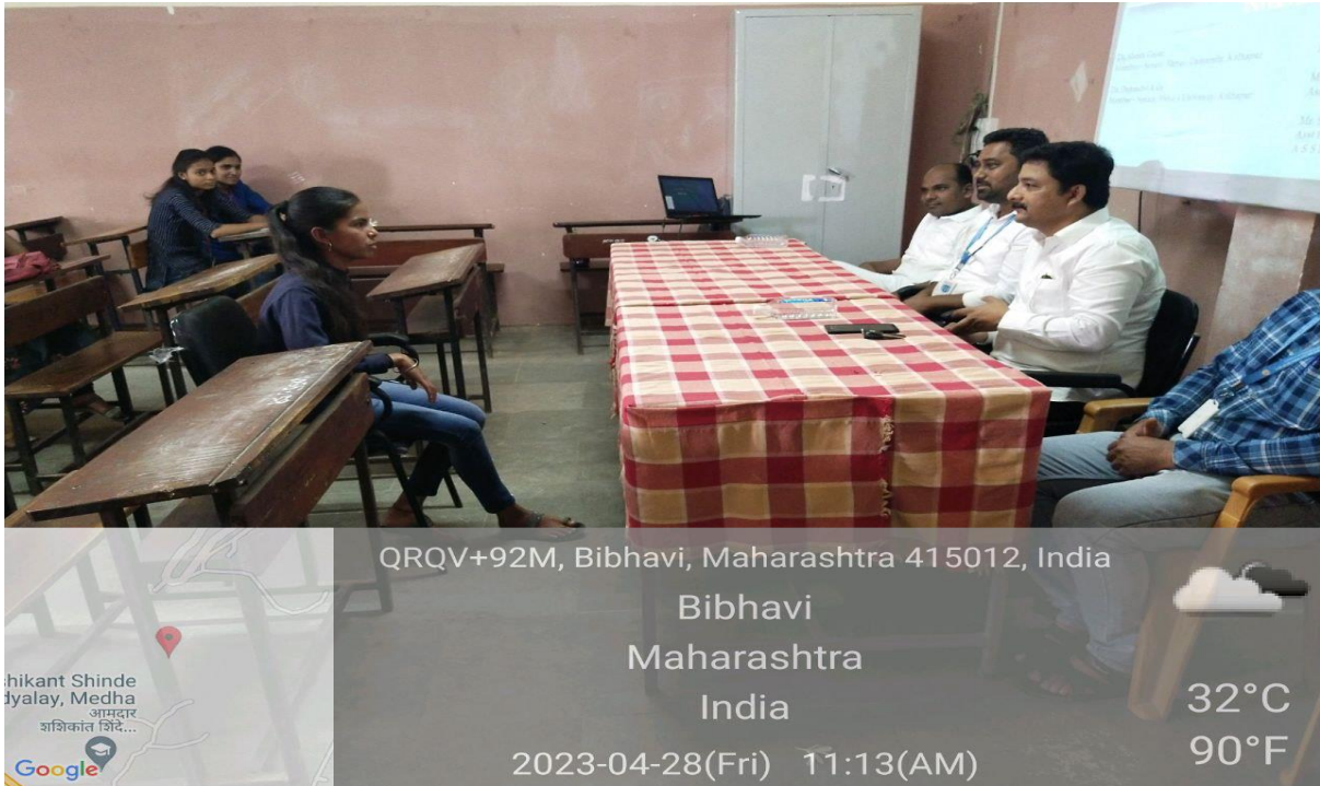
Student facing a mock interview before interview panel